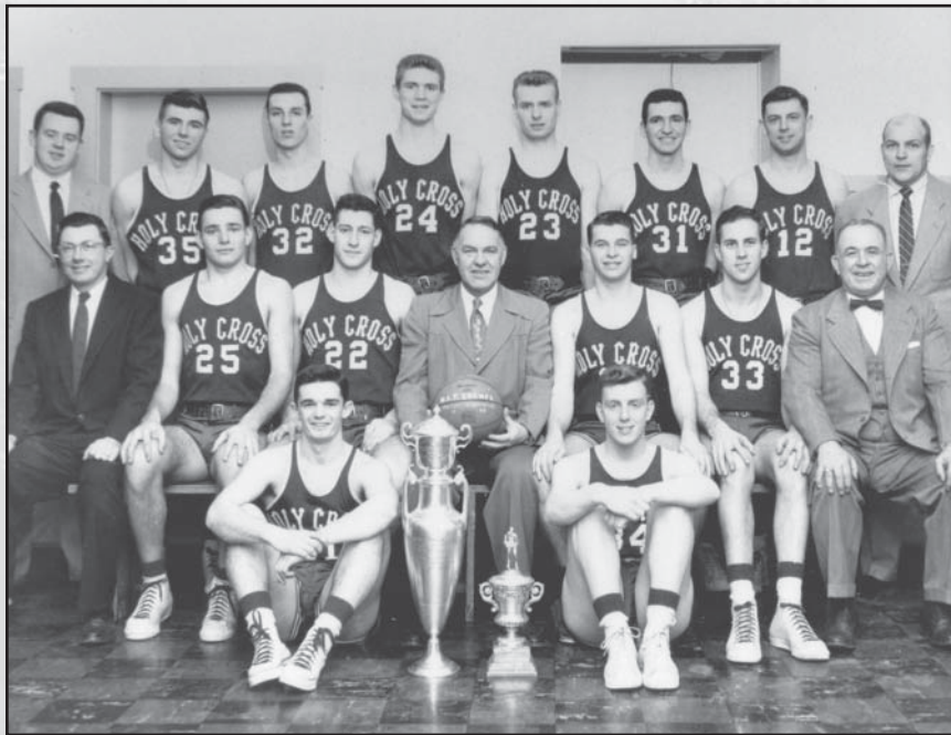
THE 1954 NIT CHAMPIONS